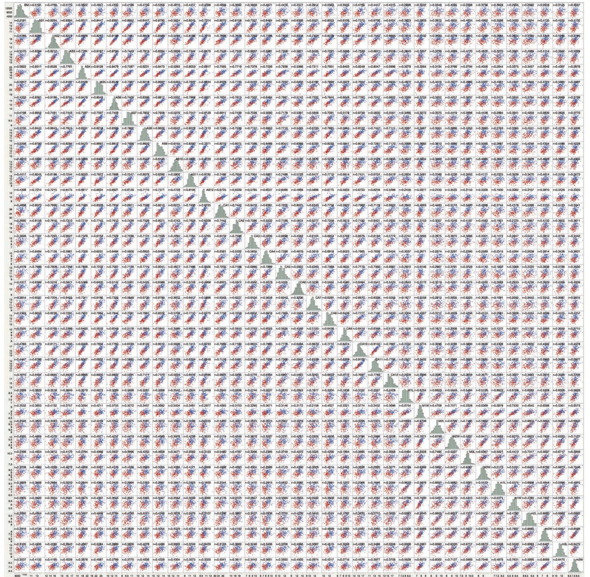
Figure A3. Scatter plot matrix of correlation for the all adult measurements. r, Pearson' s correlation coefficient. Other abbreviatons are indicated in Figures A1 and A2